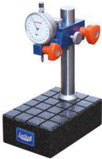
LGS - 4