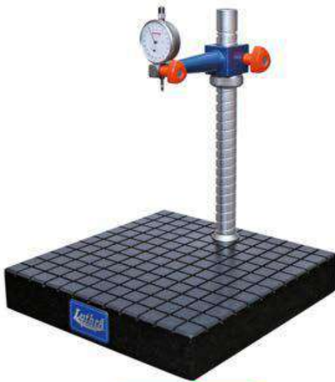
LGS - 23