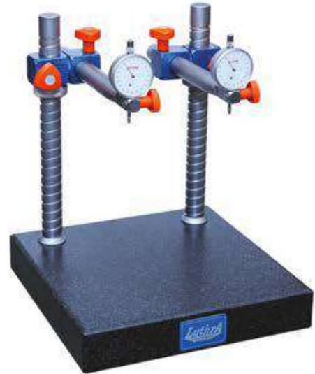
LGS - 26