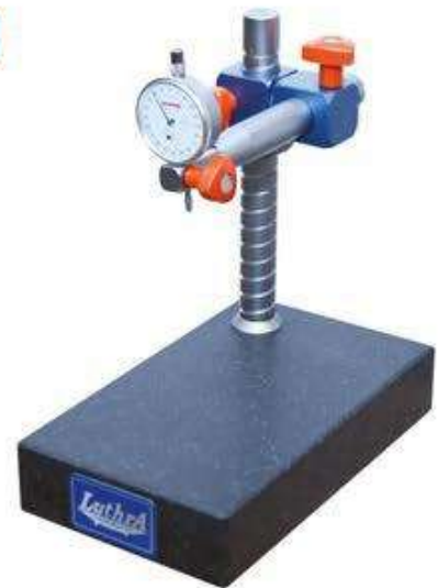
LGS - 10