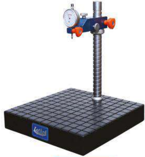
LGS - 24