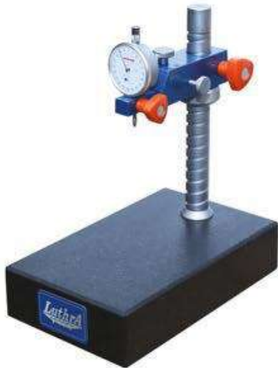
LGS - 9