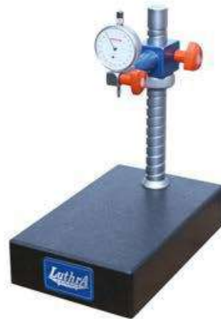
LGS - 8