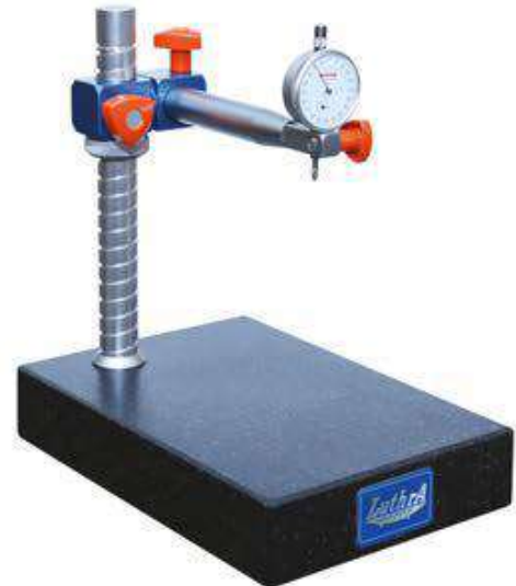
LGS - 16