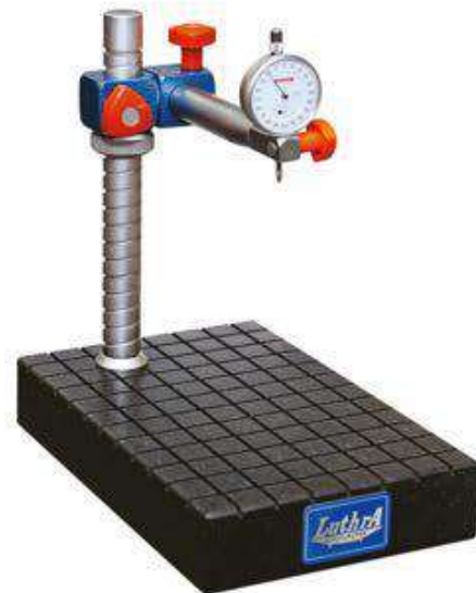
LGS - 19