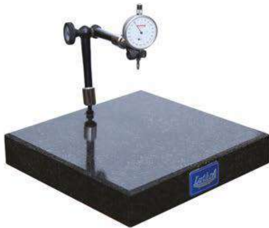
LGS - 27