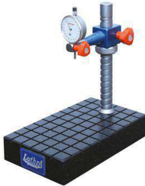
LGS - 11