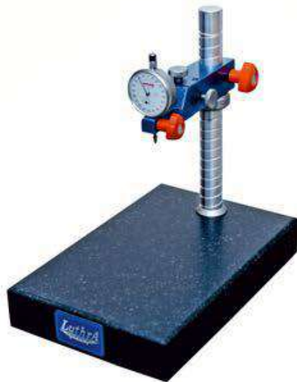
LGS - 15