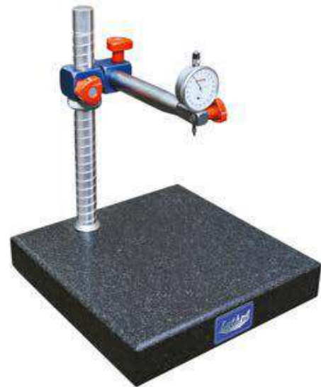
LGS - 22