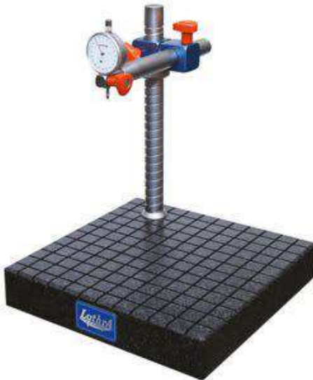
LGS - 25