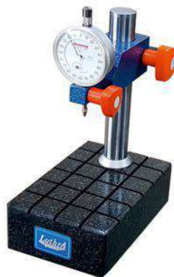
LGS - 3