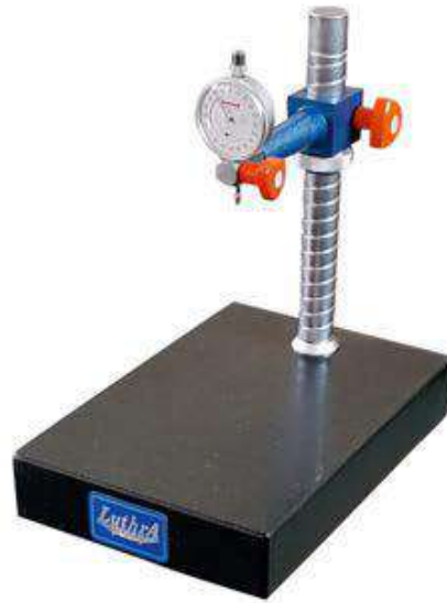
LGS - 14