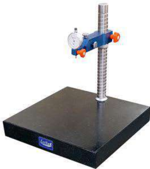
LGS - 29