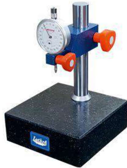
LGS - 5