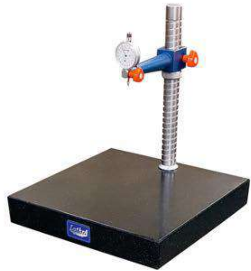
LGS - 28