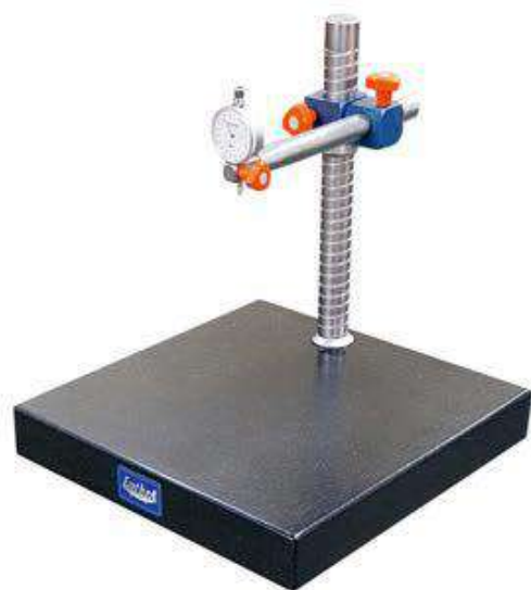
LGS - 30