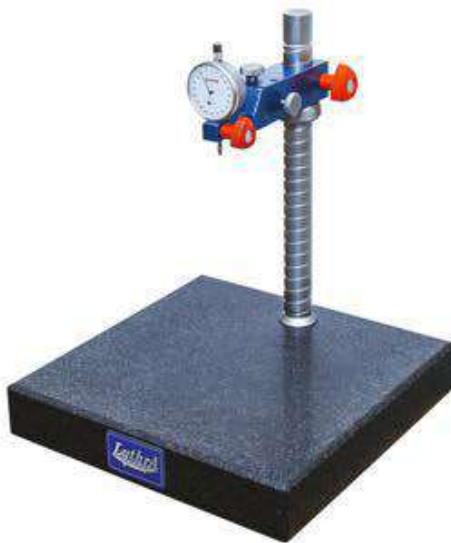
LGS - 21