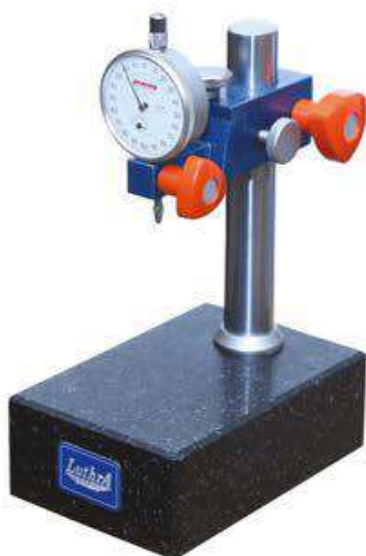
LGS - 2