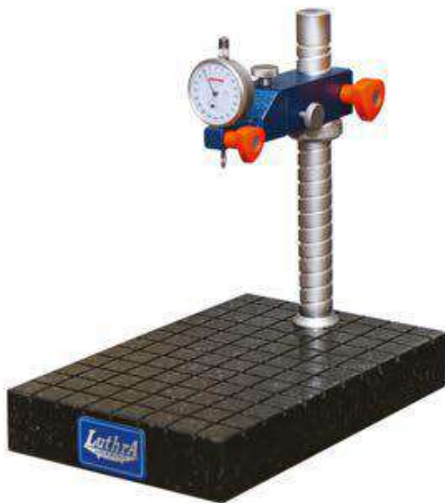
LGS - 18