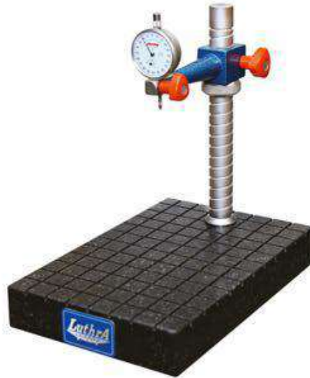
LGS - 17