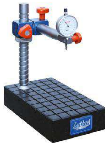
LGS - 13