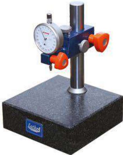
LGS - 6