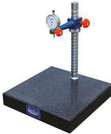
LGS - 20