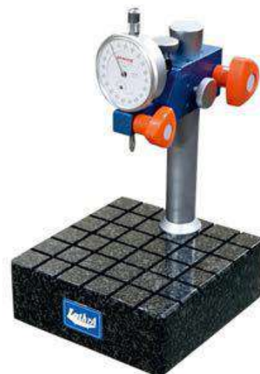
LGS - 7