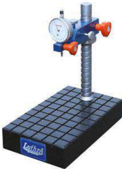
LGS - 12